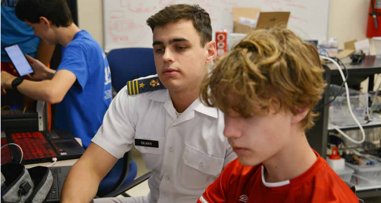
Virginia Military Institute, in collaboration with Virginia Tech, held a 12-week internship for high school students, funded by a workforce development grant from the Commonwealth Cyber Initiative. The grant seeks to build a pipeline of mentorship in which graduate students from Virginia Tech, (with more knowledge and experience on cyber security topics) mentor VMI cadets, and in turn the cadets mentor local high school students. The goal of the internship is to teach the high school students how to develop practical hardware, software, and cybersecurity skills through in-person practical learning and self-paced online training.