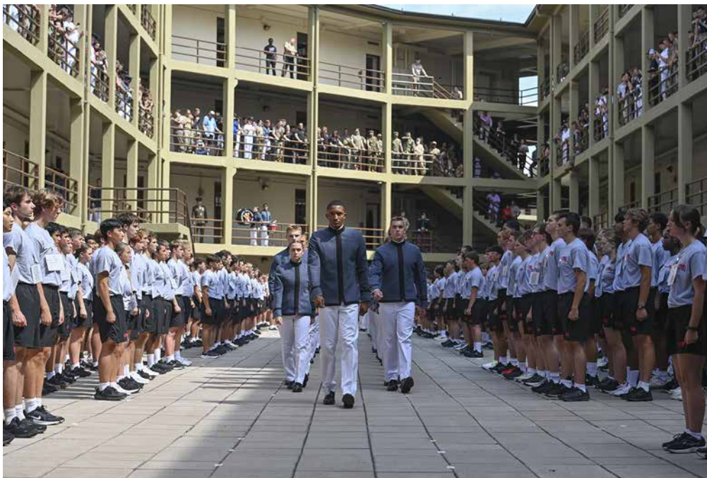
The cadre slowly march into barracks to introduce themselves to the rats Aug. 17.

The matriculants took the cadet oath during the ceremony. With hugs, cheers, and a few tears, they bid good-bye to their families and formed up with their companies for the first time. After marching up to barracks, they met their cadre, a group of cadets holding rank in each company, and are chosen based on performance and ability to serve as instructors for the Rat Mass.