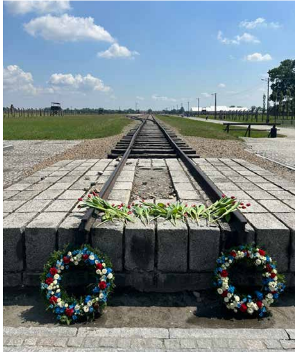
Flowers and wreaths lie in honor of those who lost their lives, following a memorial ceremony at Auschwitz.