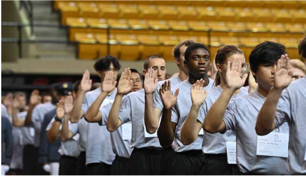
The new matriculants take their oath in Cameron Hall before marching up to barracks.

Prayer, an optional non-denominational prayer session for matriculants and their families, was held in Memorial Hall, followed by the Superintendent's Welcome in Cameron Hall.