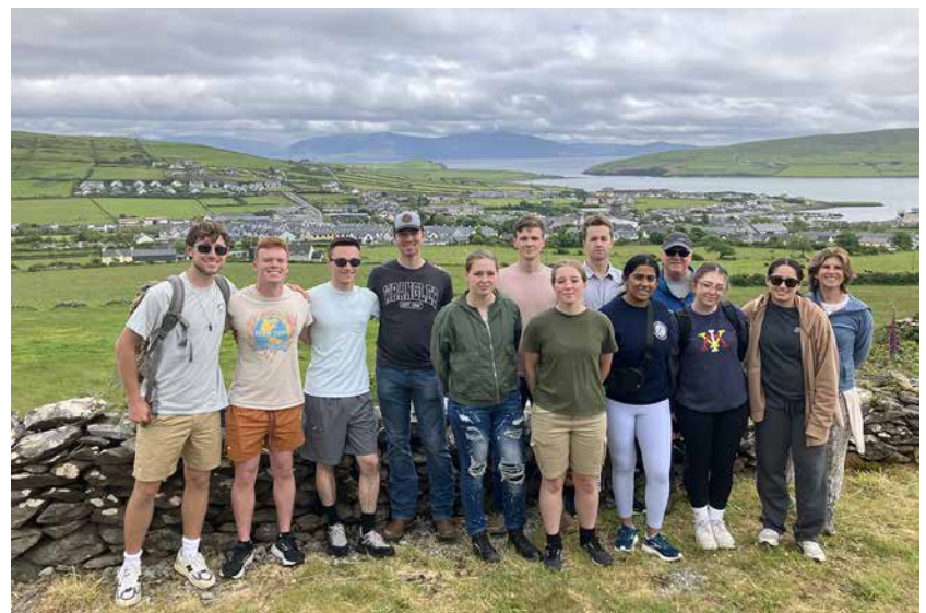
The VMI contingent gather at Cnoc a’Cairn in Ireland, the famine graveyard, overlooking Dingle Bay and the Atlantic Ocean.