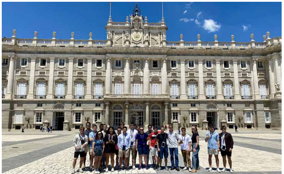
Cadets assemble in front of the Royal Palace central courtyard in Madrid.