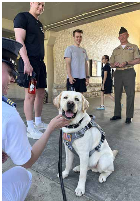
CAVU visits cadets in barracks.

Casper shared that he is blown away by the barriers CAVU is able to break down. "His presence can start conversations that probably wouldn't have otherwise happened. He has a calming presence, and he matches your attitude. If your attitude is timid or quiet, CAVU will be docile and sit at your feet, but if you get down on the ground and play with him, he will eat that up! CAVU is also able to pick up on emotions. If he senses something is not quite right with someone, he will immediately give