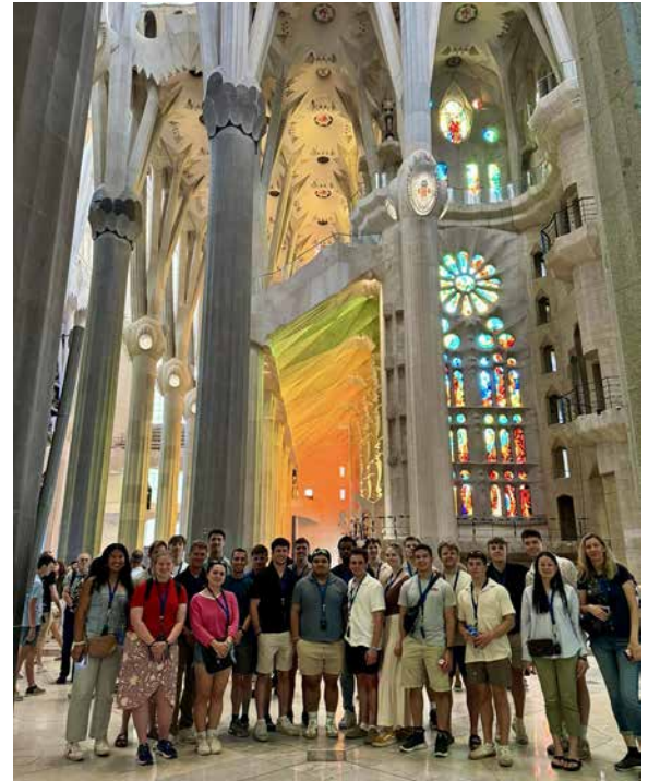
Stained glass windows at the Sagrada Família Basilica in Barcelona shine down on cadets.

with the locals about what it means to be an American, and shared common life experiences. For me, being able to experience Ireland with the cadets on a daily basis was my favorite part of the trip. Whether we were hiking Mt. Brandon, the highest point on the peninsula, or visiting a local famine graveyard, or listening to a world-renowned accordion player, we learned together the unique and rich cultural traditions. It’s such a magical place!” ❁