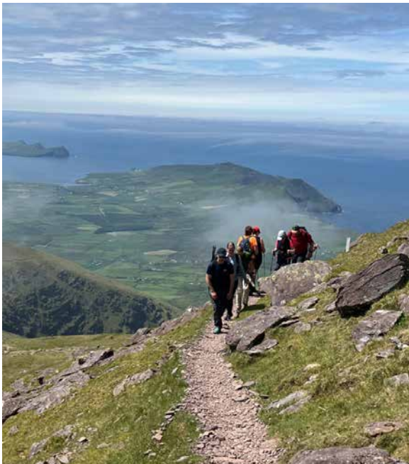
Cadets ascend Mt. Brandon, towering above the Atlantic coastline.