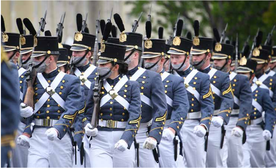
Cadets march in the Memorial Parade May 14.