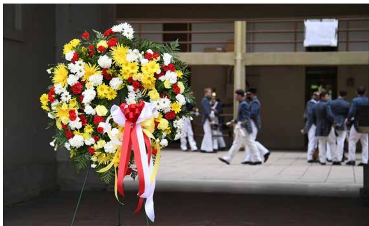
A wreath sits in Marshall Arch after the Memorial Parade May 14.