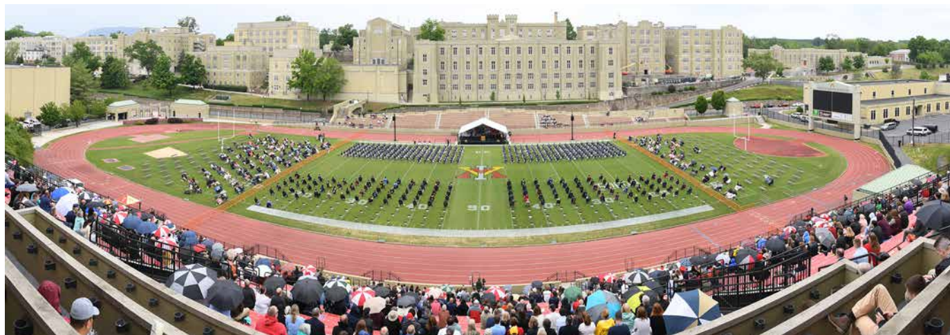
A socially distanced crowd attends the commencement ceremony in Foster Stadium May 16.