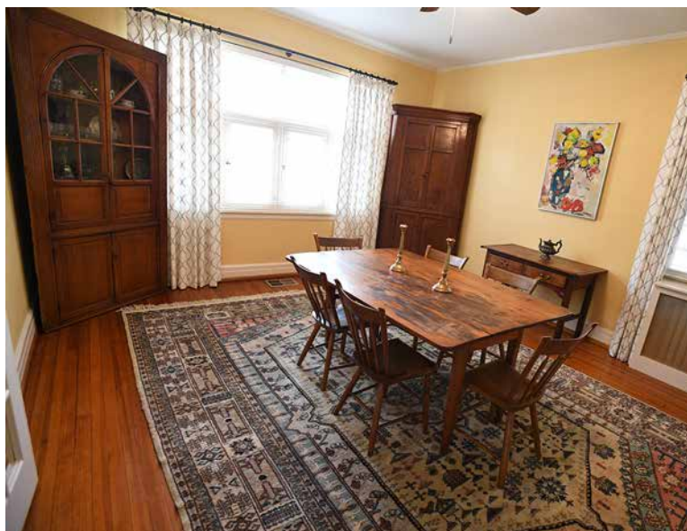
The dining table, chairs, and the rug they sit on in 402 Parade were among the many donations from the Sorensen estate.

The Sorensen home in Ohio has been left to Western Reserve Academy, a co-educational boarding and day school. ❀