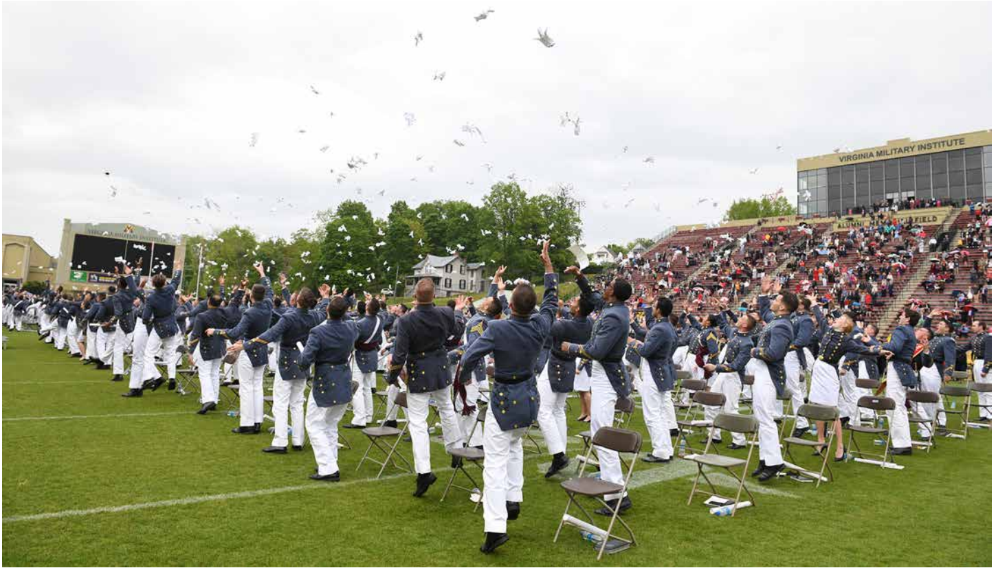
Cadets toss their gloves in the air after being dismissed from duty during the commencement ceremony in Foster Stadium May 16.