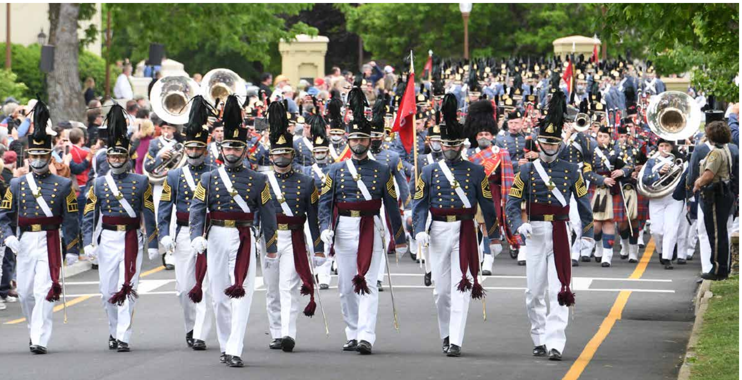
Marching band on Letcher Avenue during the Memorial Parade May 14.