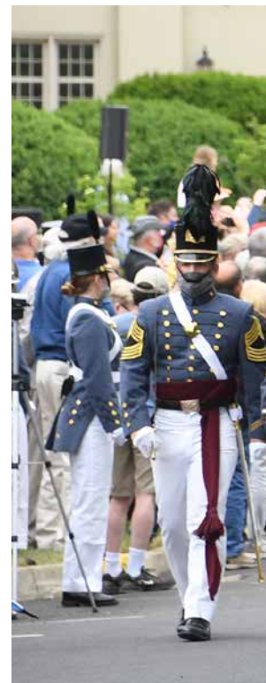
The Corps of Cadets marches down the parade ground.