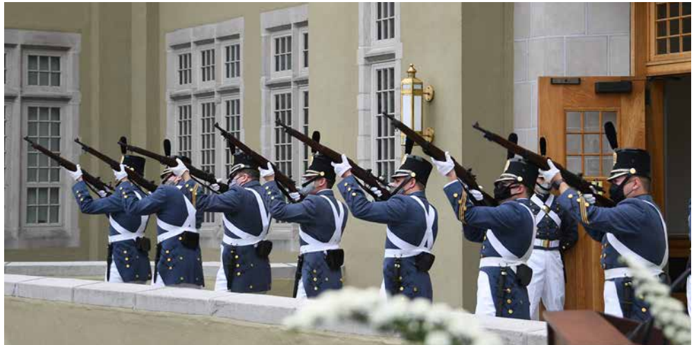
Cadets fire a three-volley salute during the Memorial Parade May 14.

Reading the names took approximately one hour, after which time the Memorial Parade stepped off. Once the Corps was formed on the Parade Ground, the commander of each company stepped forward for a roll call of deaths from each war, with a report given from one company at a time.