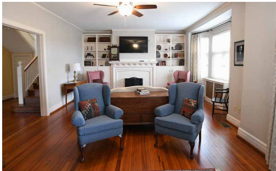
Much of the furniture in 402 Parade was donated by the Sorensen estate.