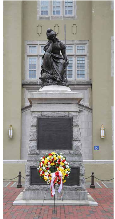
A wreath sits at the Virginia Mourning Her Dead statue after the Memorial Parade May 14.