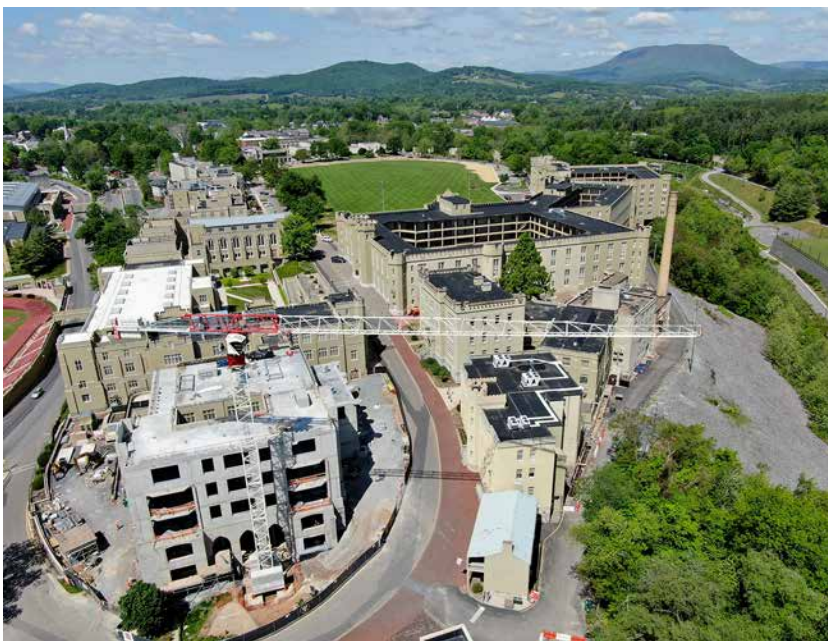
The 135-foot-tall crane was removed shortly after this photo was taken in May.

Currently, Jarvis said, approximately 40 to 50 cadet cars are parked on North Post, while 150 to 200 are