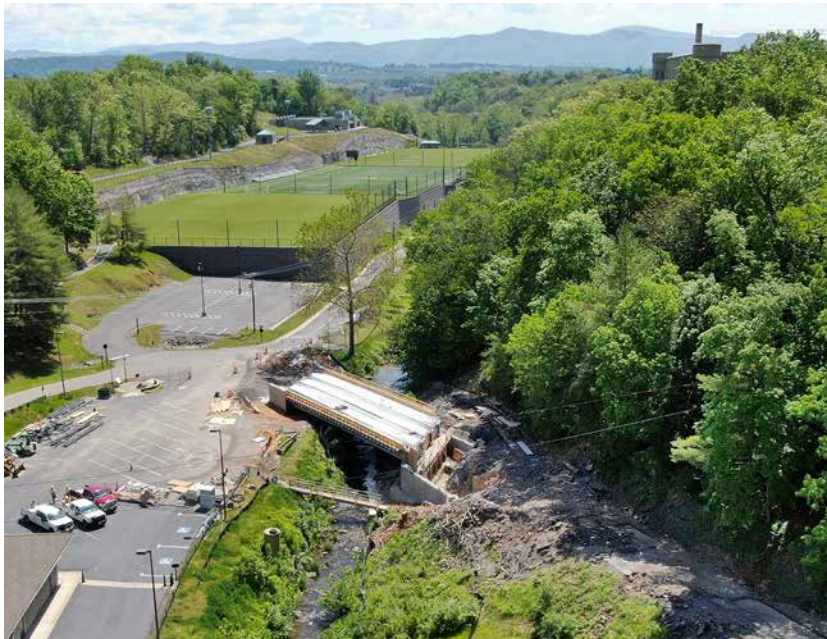
Work on Anderson Drive continues with beams in place for the widened bridge.

Beams for the new bridge were installed in late April, with the expectation that a new bridge deck would be poured before the end of May. Over the summer, a retaining wall will be built on the Gray-Minor side of Anderson Drive, the road will be widened, and a