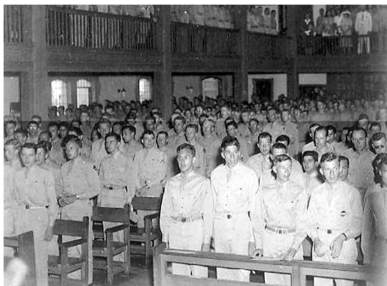
Cadets enrolled in the World War II Army Specialized Training Program graduate in July 1944 in Jackson Memorial Hall.