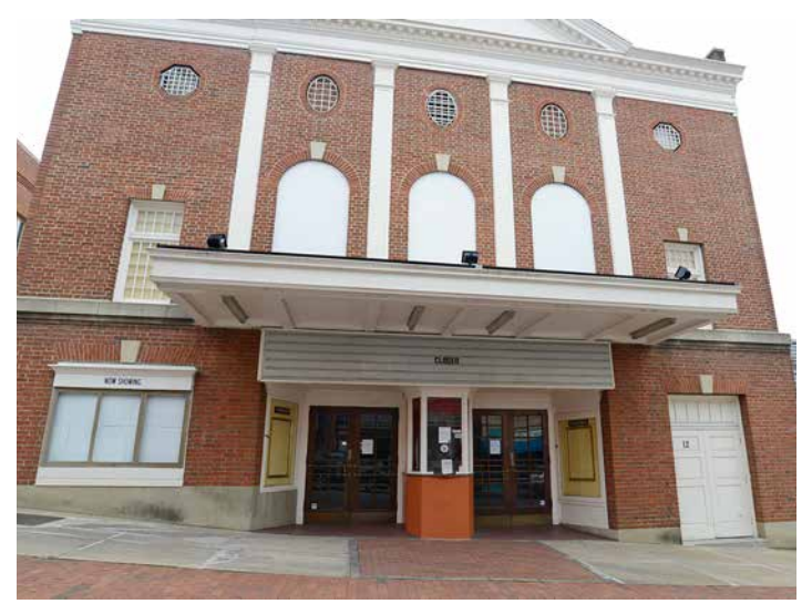
The State Theatre, and many businesses in Lexington, remain closed.

this," said Logan. Restaurants, she noted, operate on thin margins in the best of times, and business this spring has been grim. The Palms, a Lexington fixture since 1975, has temporarily closed, and many of the other spots popular with cadets, such as Pure Eats and Macado's, are doing the best they can to hold on via a carryout menu. The Southern Inn, with its classic neon sign marking its place on the