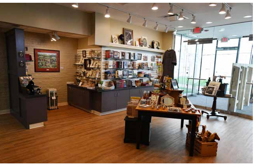
The new gift shop area for the Stonewall Jackson House will be ready for visitors once non-essential businesses are allowed to open again.