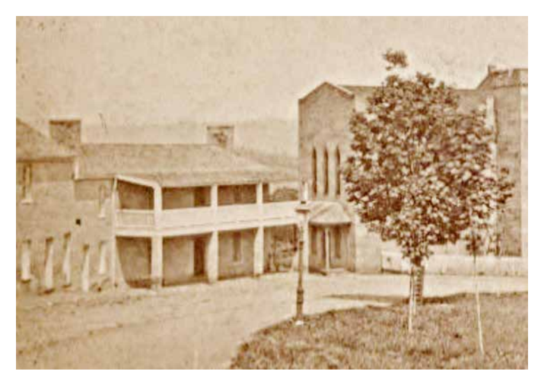
The old hospital—seen here in 1890—was built after an outbreak of typhoid fever in barracks in 1845.

Just six years after the founding of VMI, in 1845, a typhoid fever epidemic struck Lexington and the Institute. The cadets were quarantined to post. This health emergency resulted in the building of the VMI Hospital in 1848-49. The hospital could