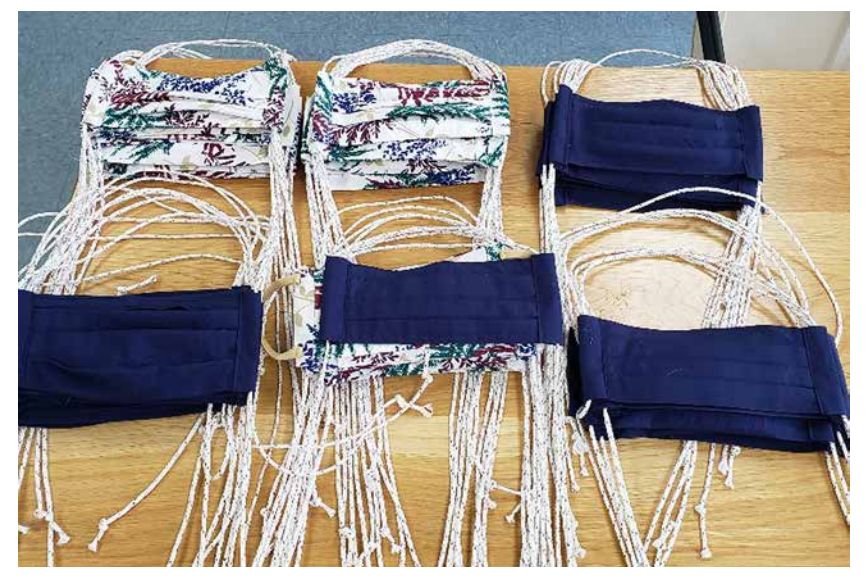
More than 500 masks have been made for the VMI community by the employees of the tailor shop.