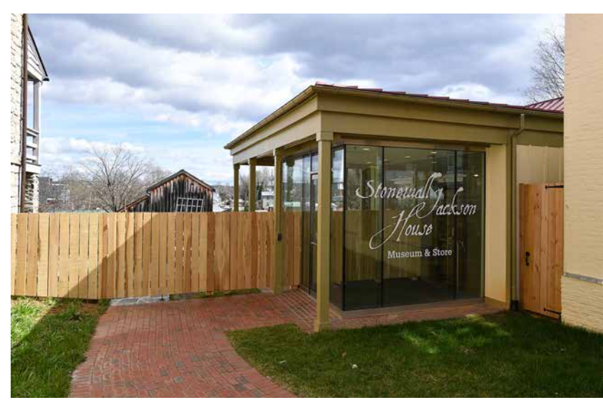
The Stonewall Jackson House briefly opened its new gift shop area in the Davidson Tucker House before having to close.

The three museums, which are the VMI Museum, the Stonewall Jackson House, and the New Market Battlefield State Historical Park approximately 80 miles to the north of Lexington, typically attract a large chunk of their annual visitors in the spring,