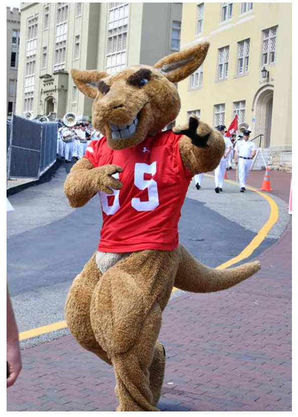
Moe was named the Southern Conference's most popular mascot.

"At the end of the day, we will continue to do the right thing by the players and program, and will work earnestly to continue to