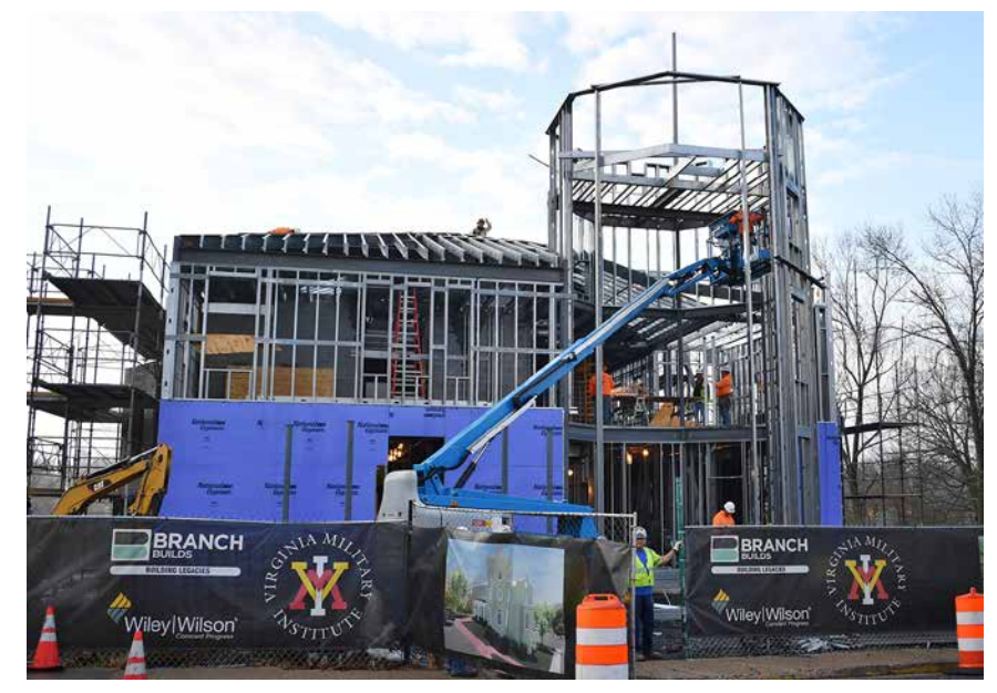
Crew members of Wiley-Wilson continue work on the post police headquarters on Letcher Avenue–VMI