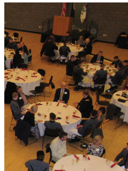
The many diners